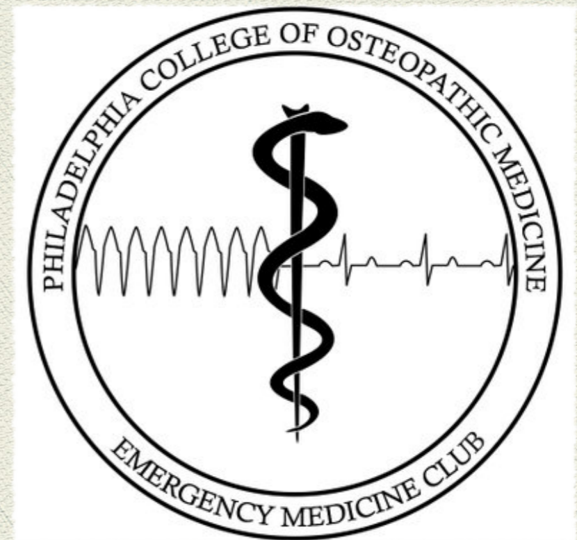
Logo on sleeve

*Shirts will be ordered @ the end of Oct